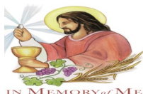
IN MEMORY of ME

Due to your generosity, we have exceeded our goal by raising $48,661.00. Through your support we are able to serve thousands of families and individuals in Worcester County through outreach, formation, evangelization, and worship. Thank you!